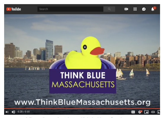
View the ad at <a href="http://bit.ly/tbm-fowl-water">http://bit.ly/tbm-fowl-water</a>

On behalf of the members of the Northern Middlesex Stormwater Collaborative, Think Blue Massachusetts ran an educational advertising campaign from May 31st to June 17th, 2022. The "Fowl Water" (In both English and Spanish) video helps viewers visualize stormwater pollution in their community: