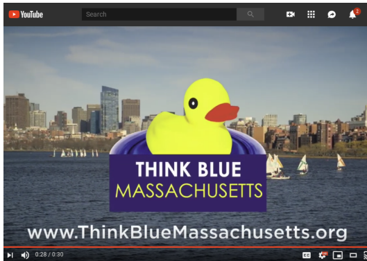
View the ad at http://bit.ly/tbm-fowl-water

On behalf of the members of the Mystic River Watershed Collaborative, Think Blue Massachusetts ran an educational advertising campaign from May 31st to June 17th, 2022. The “Fowl Water” (In both English and Spanish) video helps viewers visualize stormwater pollution in their community: